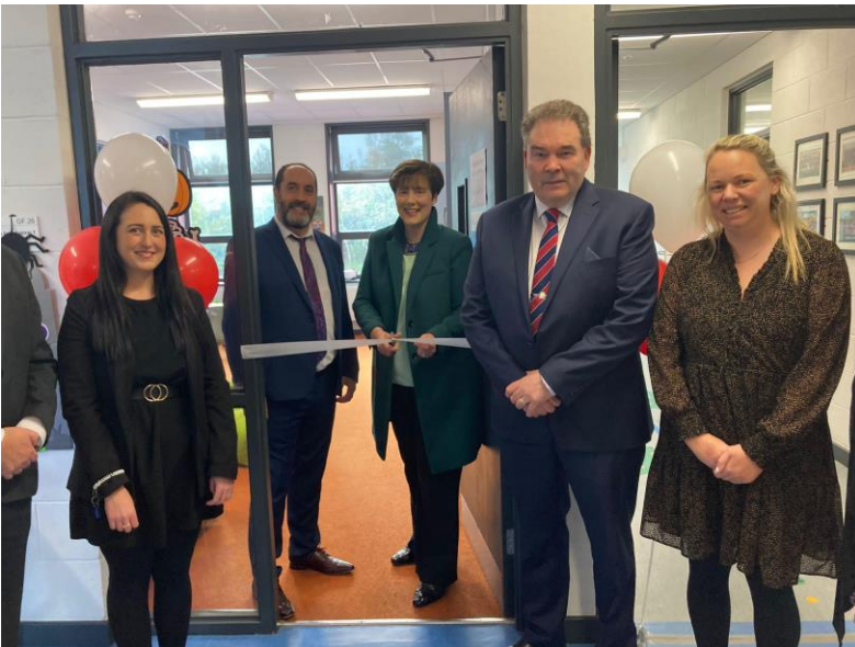
Minister Norma Foley officially opening the Nurture Room in Scoil Bhríde.

The Sunshine room was opened by Norma Foley on her recent visit.